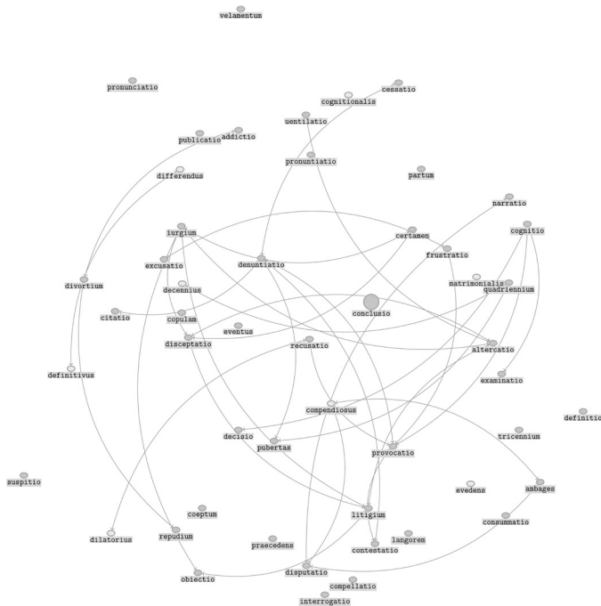
Figure 4. Local graph view of conclusio (NN); genre: legal texts (see Table 5); method: CBOW (Mikolov et al., 2013).

In this section, we apply the method of local graph views to Latin word embeddings as provided by SemioGraph, briefly present four SemioGraphs and sketch how they may provide a new kind of evidence for computational historical semantics in the humanities. In our first example we calculate paradigmatic associations (Rieger, 1989) of the noun conclusio “conclusion” in the test corpus of legal texts (see Table 5). The resulting SemioGraph (see Figure 4) allows first observations on the principle functionality of SemioGraphs for a comparatively small corpus, on the potentials of genre-sensitive SemioGraphs, and at the same time on necessary further work and current performance of the FLL and TTLab ’s tagger and lemmatizer for Latin.